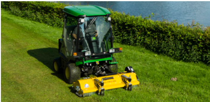
Müthing MU-FM VARIO Front with 2-point linkage