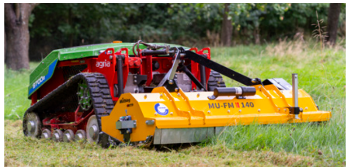
Müthing MU-FM VARIO Front/Rear with 3-point linkage, Cat. 1