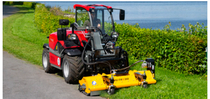
Müthing MU-FM VARIO Front with hydraulic drive