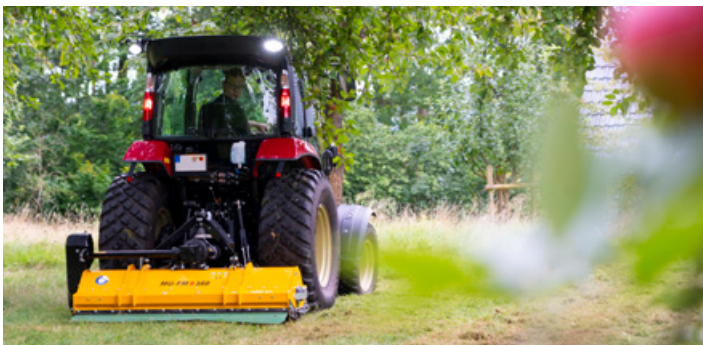
Müthing MU-FM VARIO Front/Rear with 3-point linkage, Cat. 1